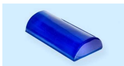
Dome shaped pads