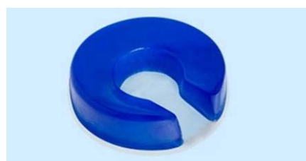
Bowl shaped horseshoe