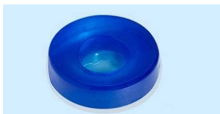
Bowl shaped head pads