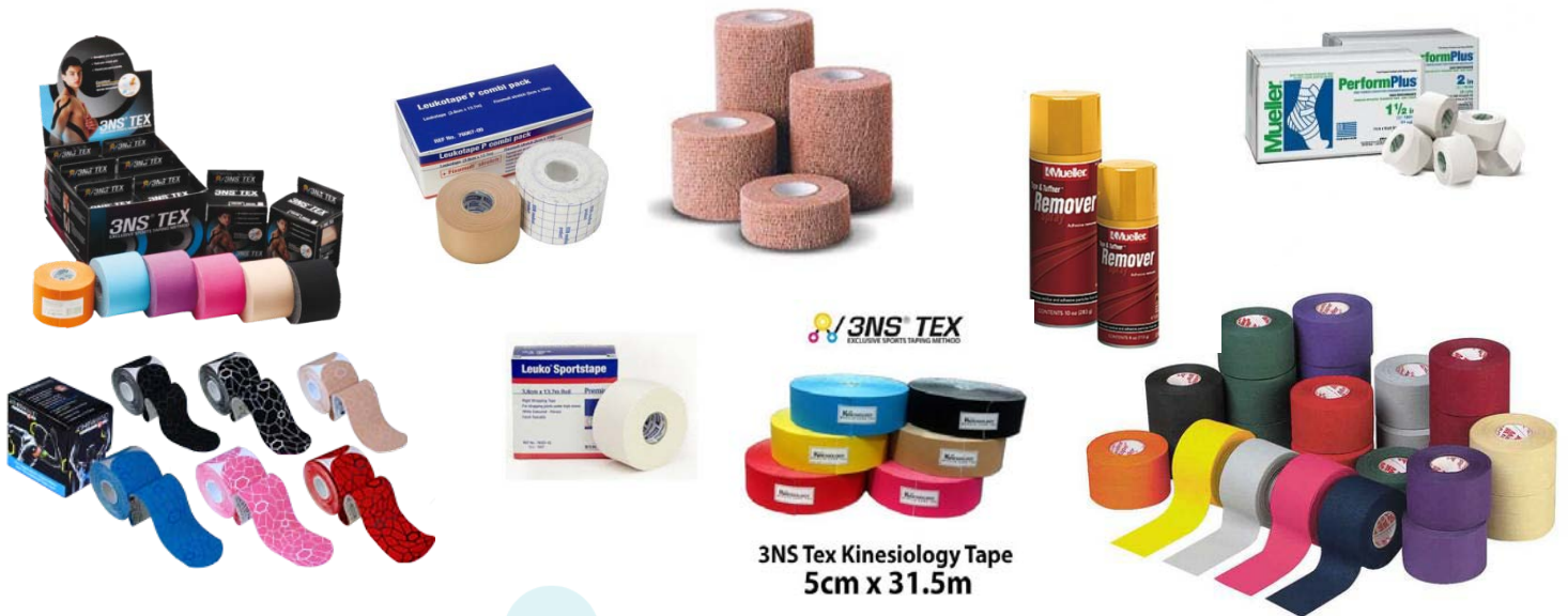
3NS Tex Kinesiology Tape 5cm x 31.5m