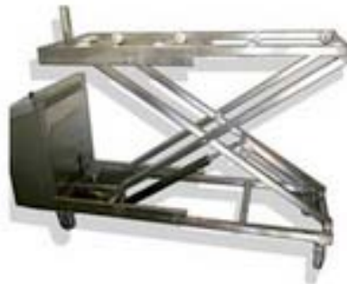
Electric lifting trolley