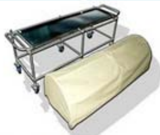
Transport trolley with cover

Equipment for use in Mortuaries and Funeral Homes. For Cadaver lifting and transport Manual and electric lifting trolleys. Transport trolleys Covered transport trolleys. Washing, preparation and embalming tables. Replacement body trays and racking.