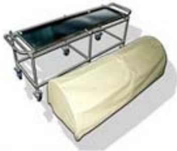
Transport trolley with cover