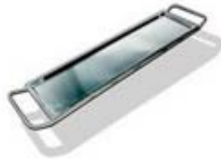
Body tray 550mm and 650mm width available